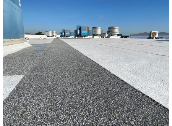
4. EPDM integrated walk-ways