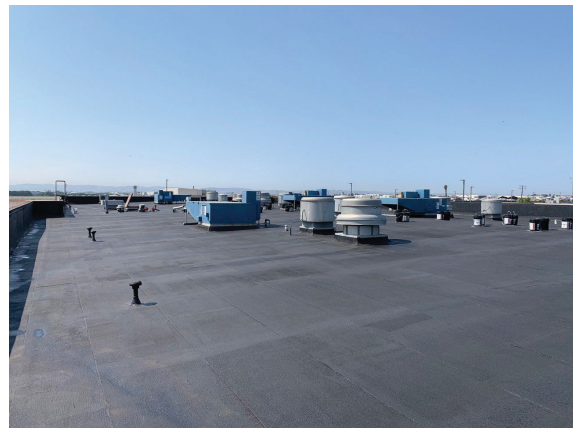
2. Cap Sheet coated with IPP Rubber