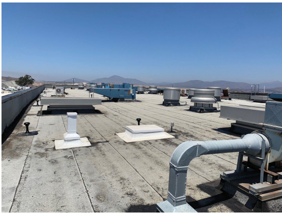
1. Cap Sheet roof cleaned for SRR System