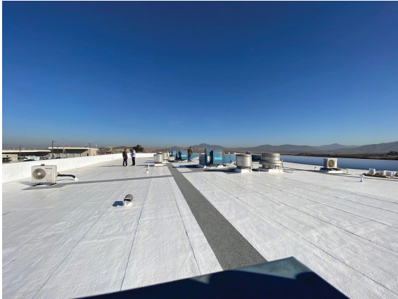
3. HS 250 Silicone UV stable highly reflective